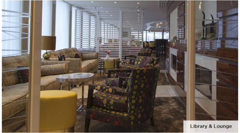
Library & Lounge